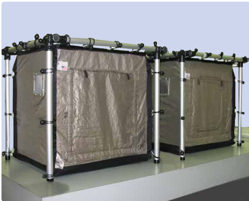
Series 500 Tabletop Enclosure

Portable and more cost effective than rigid metal boxes, Select-A-Shield tabletop enclosures deliver maximum isolation plus they are easy-to-assemble, easy to move, and easy to store for optimum versatility.